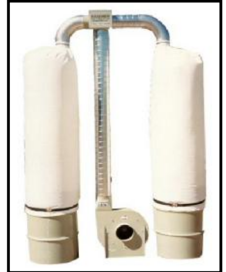
Dust Collection System