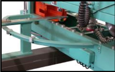
Support Ring mounted to saw frame