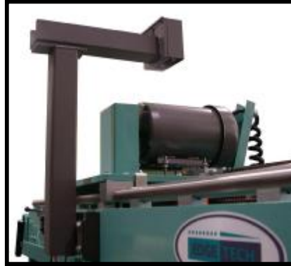
Dual Laser Alignment