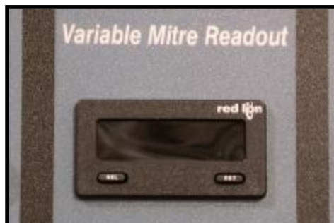
Variable Mitre Brake and Digital Display