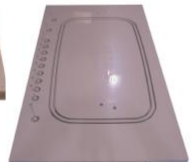
Typical polypropylene follower templates