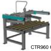
CTR960 Countertop Router